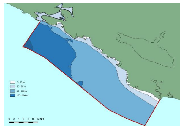
Figure 1. Continental shelf area (depths of up to 200 m) within the territorial sea of Montenegro

submarine area of internal seawaters, territorial sea and epi-continental area of Montenegro as defined by the Law governing the sea. Montenegrin coast is 284 km long, of which 112 km are the coast of Boka Kotorska Bay, and 11.1 km are the coast of islands. The surface of the internal Montenegrin waters is 362 km 2 , the surface of territorial sea is 2 098 km 2 , the surface of coastal sea is 2 460 km 2 , while the surface of epi-continental area is around 3 885 km 2 , Figure 1 (Pešić et al. , 2011).